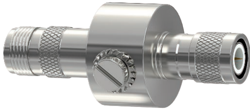
Coaxial data cable protection devices