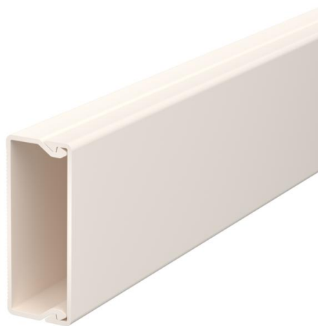
Trunking cover and base with base perforation.