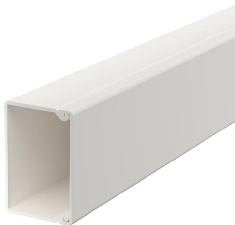
Trunking cover and base with base perforation.