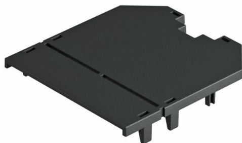
Plate can be reduced to 61 mm as required.

Cover plate, blank, for closing off unused installation space of the UT3 universal support.